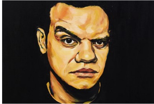
Meyne Wyatt 2020