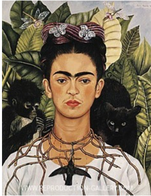
Frida Kahlo 1940